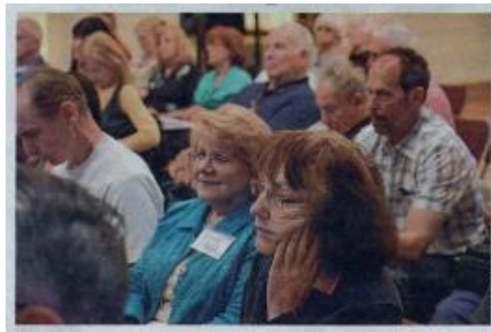
SeniorNet volunteers attend an orientation meeting in Greenlawn.