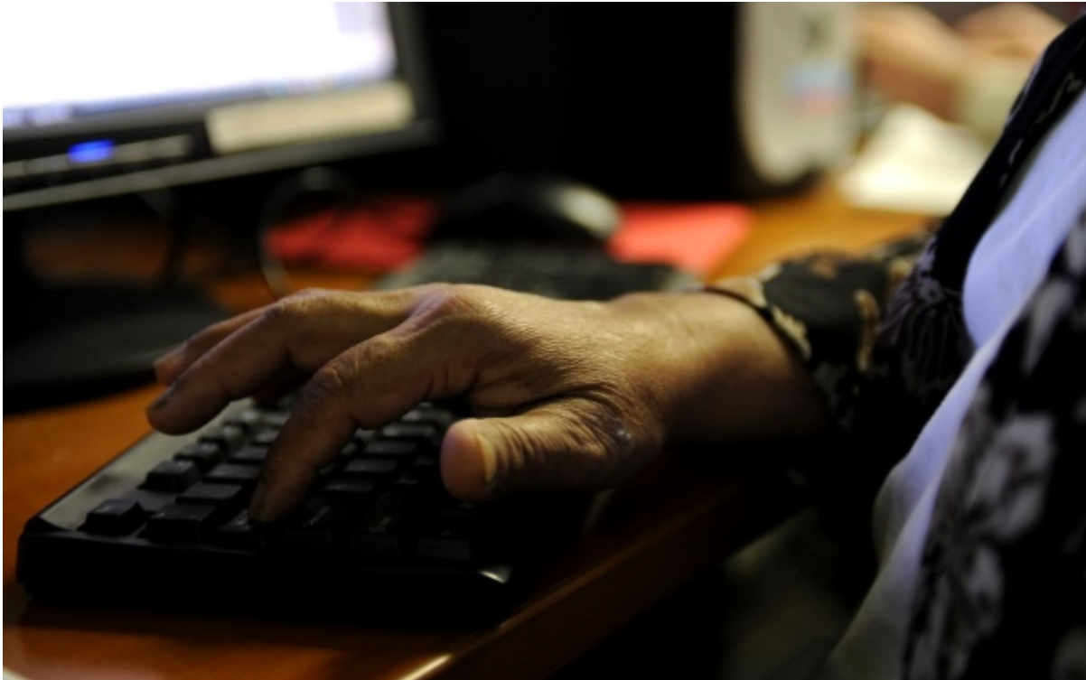
It's never too late to pick up a new skill, as those who uses SeniorNet to learn how to use computers discover. (October 2009)

December 11, 2009 By KAY BLOUGH □ Special to Newsday