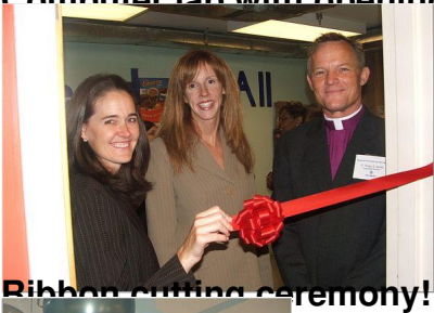
Ribbon cutting ceremony!