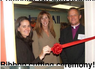
Ribbon cutting ceremony!