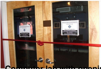
Computer lab with opening ceremony ribbon on the doors